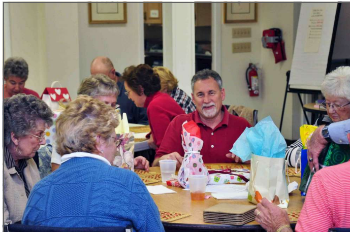
SPARKS Dirty Bingo Night