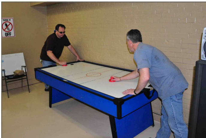
Men in Mission—working hard!