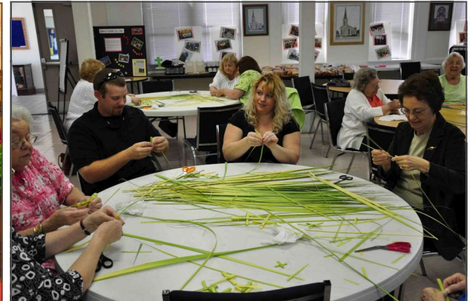
Palm Sunday Activities