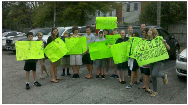
Azalea Festival Parking